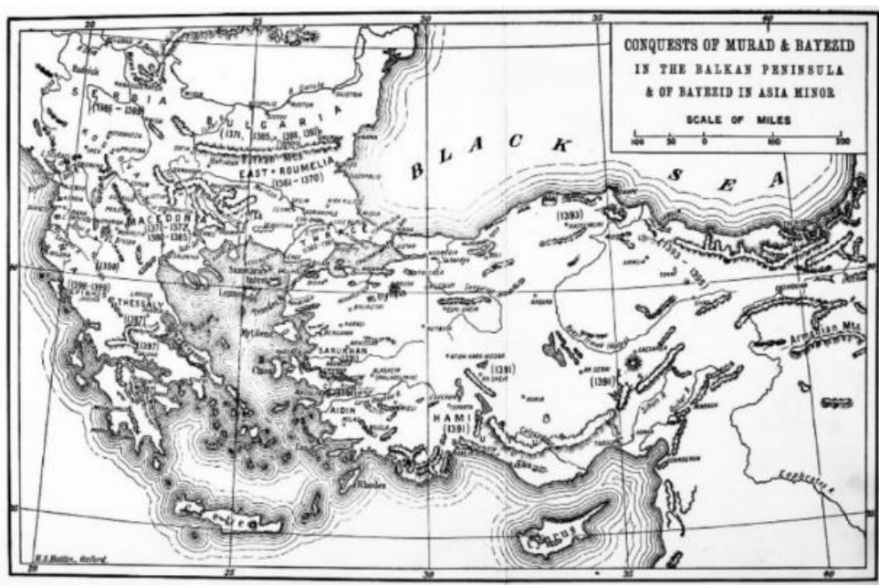
Picture 1.1 Map of Ottoman territorial expansion during Murad I and Bayazid I in the Balkans and Asia Minor