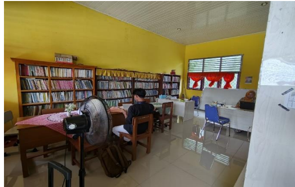
Figure 2. Library room at SMPN 2 Pemulutan Selatan

The SMPN 2 Pemulutan Selatan library was established at the same time as the school was founded, namely in 2006. The SMPN 2 Pemulutan Selatan library has one Head of Library and one librarian. This library is in a room that functions as a library. So if based on library standards, the library at this school is still far from adequate. However, despite this, the role of the library is quite large, especially for school residents.