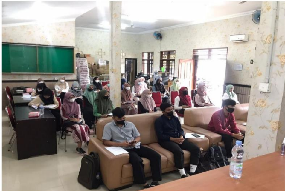
Figure 3. Training Participants