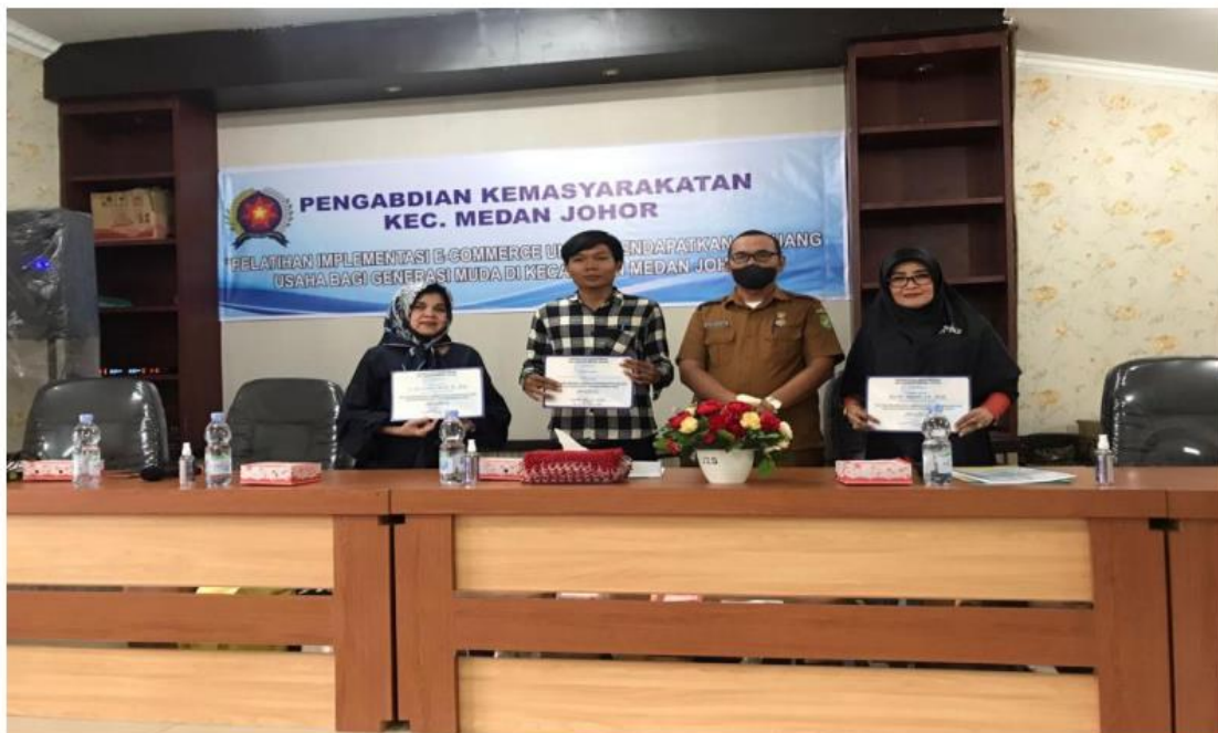
Figure 1. Joint photo with Medan Johor Government officials