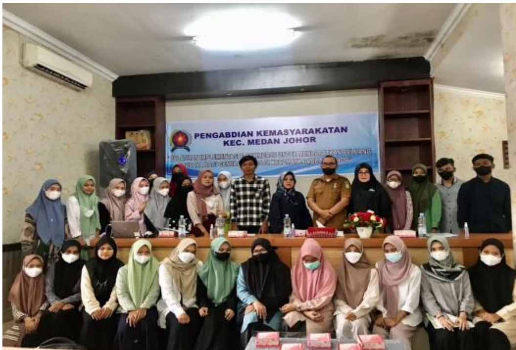
Figure 6. Group Photo with the PKM Team