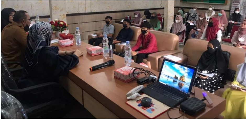
Figure 2. Implementation of Community Service