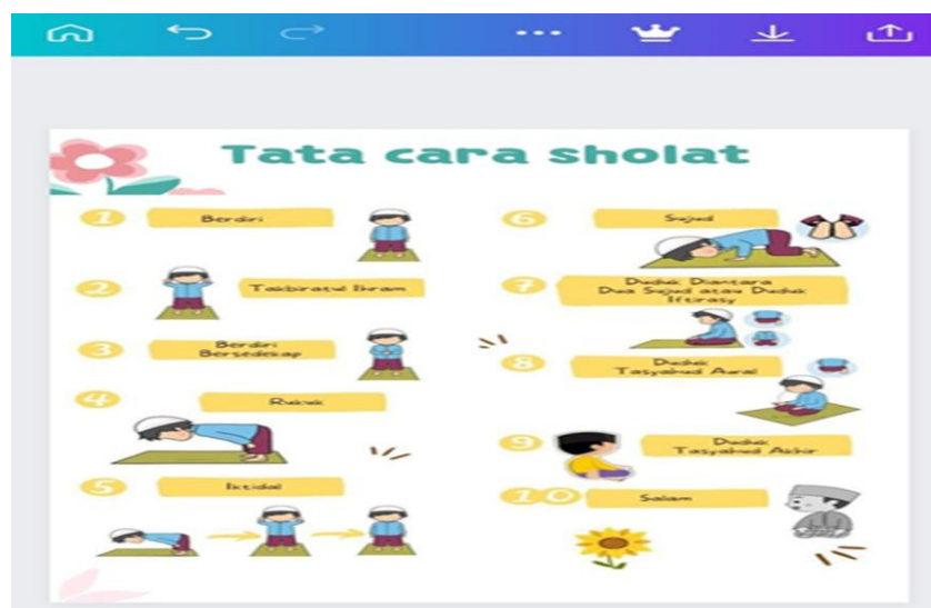
Figure 3. Prayer material procedure