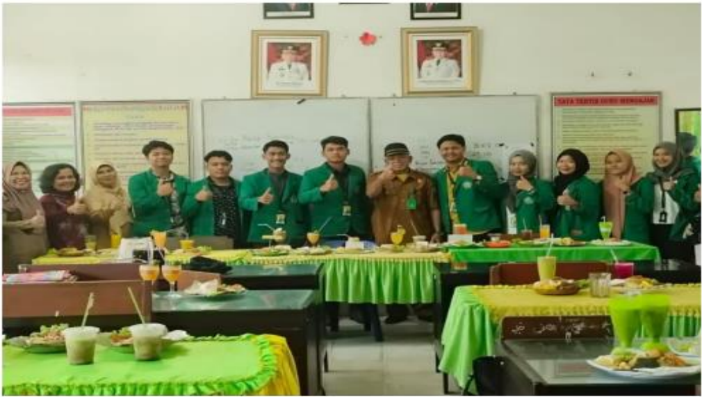
Figure 4. Photos During Seminar Activities