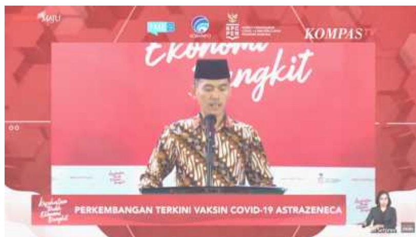
Figure 1. AstraZeneca Covid-19 Vaccine Press Conference

Informatics and the Committee for the Handling of Covid-19 and the Acceleration of National Economic Recovery on 19 March 2021. Its speakers included three resource persons from Indonesian Ulema Council (MUI), POM Agency, and the Ministry of Health. Furthermore, this study aimed to dissect the five elements of da'wah communication at the press conference.