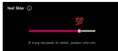
Figure 1.1 Slider results for the question "Do you often use Microsoft Word?"

As for the question "Do you often use Microsoft Word?" asked via the slider feature which was responded to by 31 accounts from 60 respondents and 139 participants. The average answer from the results of this slider is almost close to the finish line, an estimate of \frac{3}{4} of 100%. The slider results are attached in Figure 1.1 below: